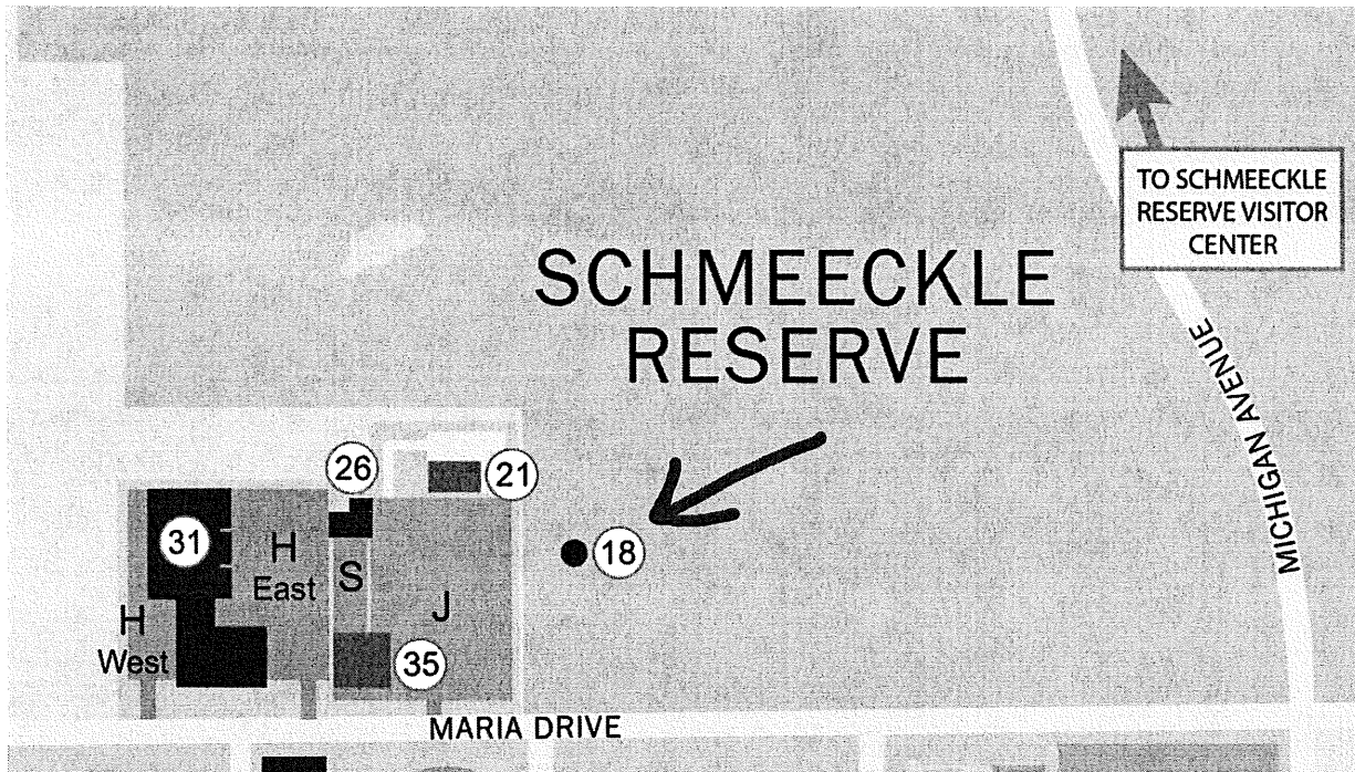
Figure 2. Map of Schmeckle showing the meeting location at Schmeckle pavilion, labeled number 18.